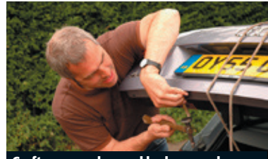
Craftsman made panel look as good as new